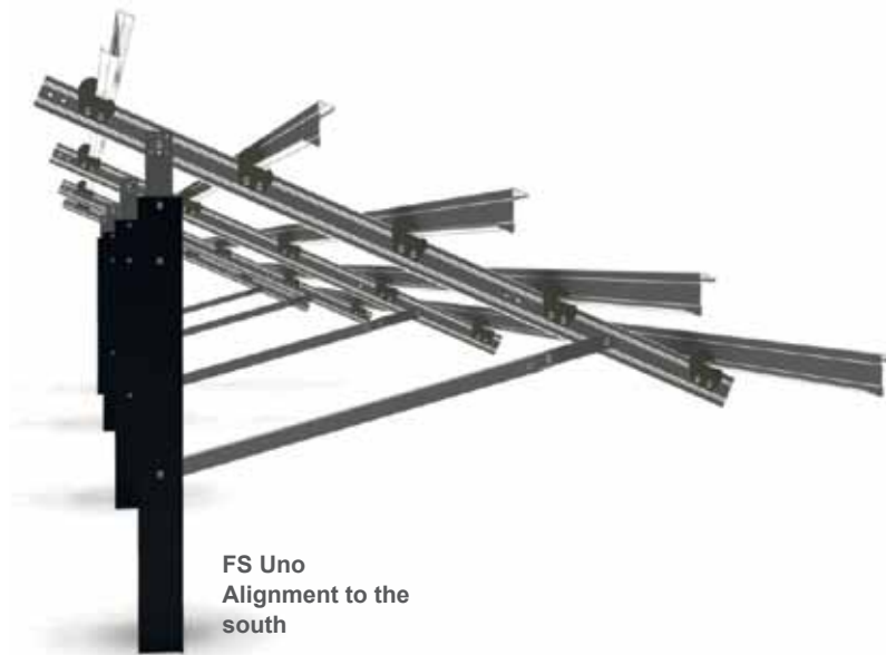
FS Uno Alignment to the south

All the experience gained in these projects was taken advantage of in this new design made of steel which resulted in an even more price-efficient way to mount solar modules. Especially in the sector of open area plants, the increasing cost-pressure makes an optimum material utilization unavoidable. With our the FS steel system, this principle was implemented uncompromisingly.