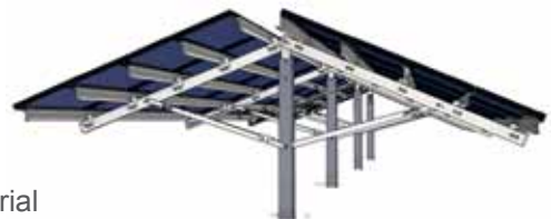
FS Uno-100 Aligned both to the east and to the west